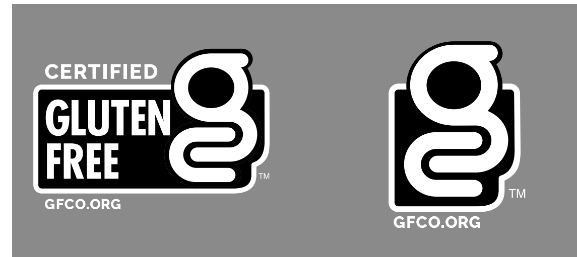
----- REVERSED OPTIONS -----